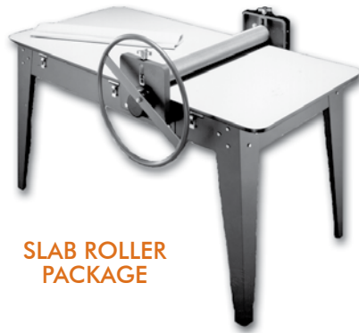
SLAB ROLLER PACKAGE