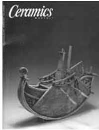
CERAMICS MONTHLY $7.50