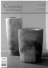
CERAMICS ART AND PERCEPTION $20.00