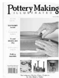
POTTERY MAKING ILLUSTRATED $5.00