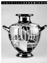
AMERICAN CERAMICS $10.00