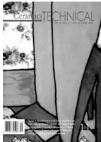
CERAMICS TECHNICAL $20.00