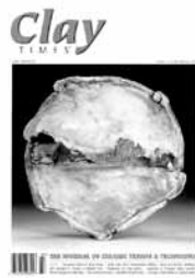
CLAY TIMES $7.50