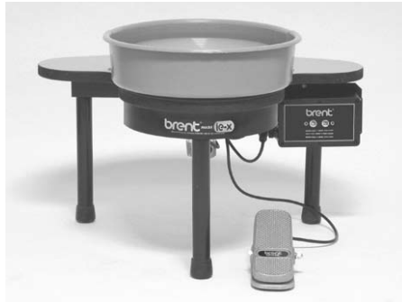
MODEL IE/IE-X (models have similar appearance)