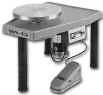
MODEL EX/CXC/C/B (models have similar appearance)

All Brent wheels have sensitive electronic foot pedal controls, smooth-running permanent magnet D.C. motors, reversing switches, and all-steel construction. Brent's electric wheels are very sturdy and dependable. Each wheel comes with a five-year warranty. Brent wheel accessories are listed on page 60.