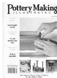
POTTERY MAKING ILLUSTRATED $5.00