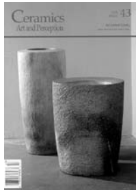
CERAMICS ART AND PERCEPTION $20.00