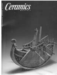
CERAMICS MONTHLY $7.50