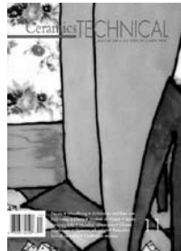
CERAMICS TECHNICAL $20.00