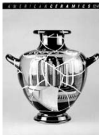
AMERICAN CERAMICS $10.00