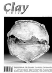
CLAY TIMES $7.50