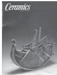
CERAMICS MONTHLY $7.50