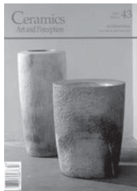
CERAMICS ART AND PERCEPTION $20.00