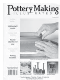
POTTERY MAKING ILLUSTRATED $5.00