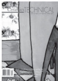
CERAMICS TECHNICAL $20.00