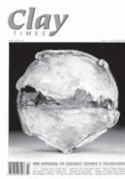
CLAY TIMES $7.50