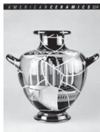
AMERICAN CERAMICS $10.00